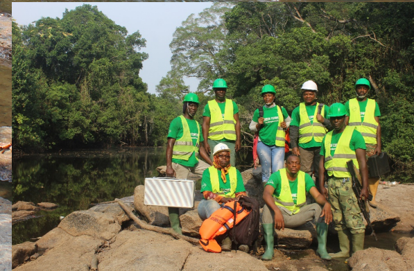
The whole team during a field trip in the Mpem and Djim locality, Cameroon

In 2013, she received the OWSD PhD grant and is a member since then. Became member of OWSD-CAM in 2019, and was elected financial secretary the same year